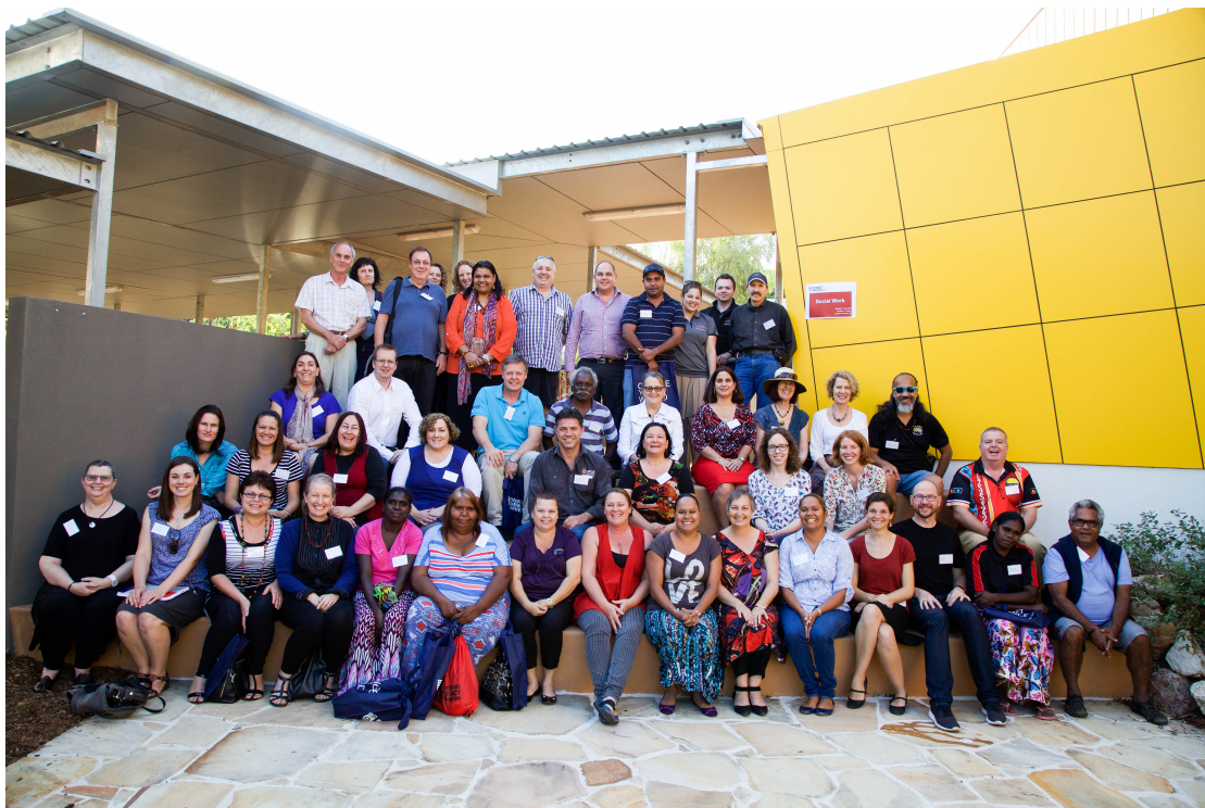
Broadband for the Bush Indigenous Focus Day 2015 | Darwin, Charles Darwin University

The Indigenous Day Forum concluded that the maintenance of traditional knowledge continues to evolve over a sixty thousand year legacy, adapting to changing conditions and emerging opportunities. Non-western cultural perspectives must negotiate continuously with global imperatives and systems. While systems hosted with communities seem vulnerable, representatives must tread carefully when negotiating property rights to corporations or onto the "cloud." Intellectual property transactions become that much more acute in a commoditized world where everything seems convertible into monetary value. Toward achieving a comfortable balance between perpetuity and change, the new communication software and hardware must support an emerging new social infrastructure that builds on the strength of traditional knowledge in a rapidly evolving digital world.